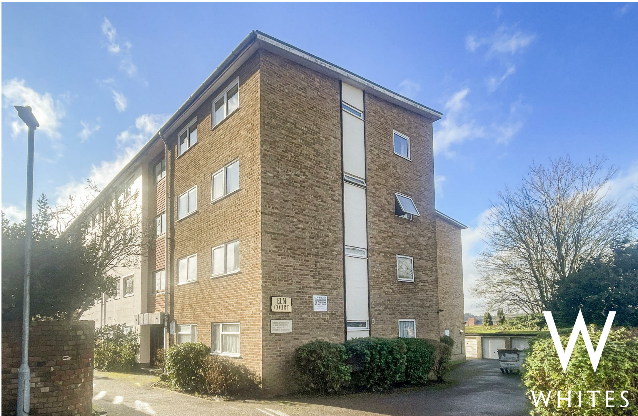
Flat 11, Elm Court Elm Grove Road, Salisbury, SP1 1JN